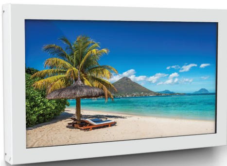
Screen simulation 40"

Part numbers : ENCLOSURE_I_32 ENCLOSURE_I_40 ENCLOSURE_I_42 ENCLOSURE_I_46 ENCLOSURE_I_55 ENCLOSURE_I_65