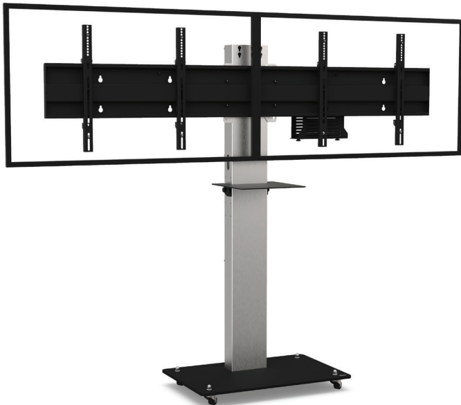
Screens simulation 46"

Part numbers : BOXERD4050VCPACK BOXERD5255VCPACK